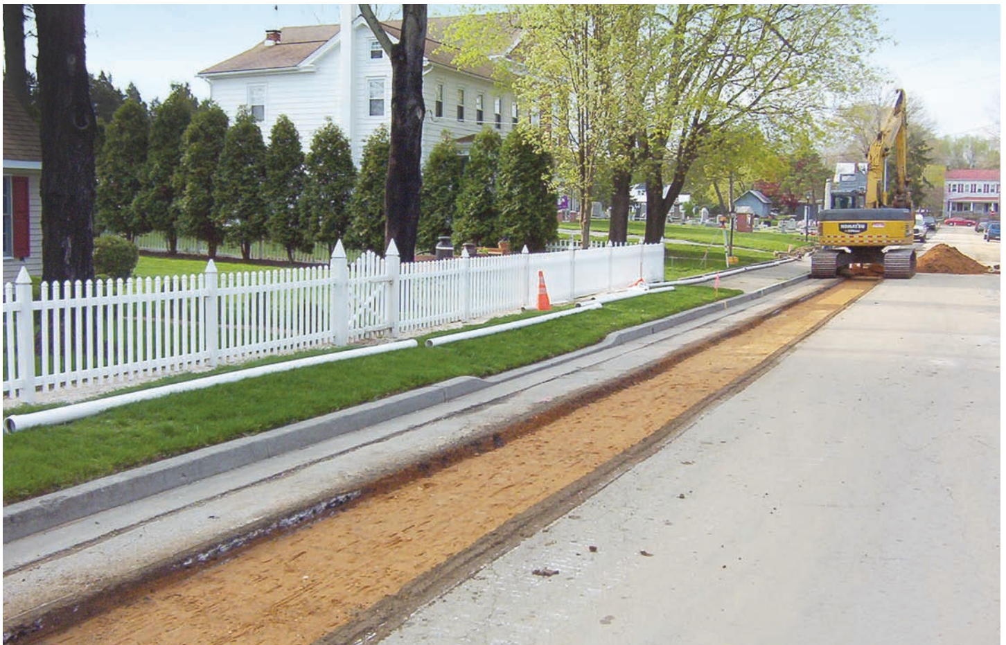
Vacuum sewer installation causes minimal disruption to neighborhoods. Trenches are shallower, less excavation is required and streets can remain open to traffic.

Alloway had been looking to replace its septic tanks for decades. A new sewer was first proposed back in the early 1970s, but cost and inconvenience delayed the project until 2007. When engineers first looked at designing a conventional gravity sewer, they realized that Alloway presented numerous and significant installation obstacles.