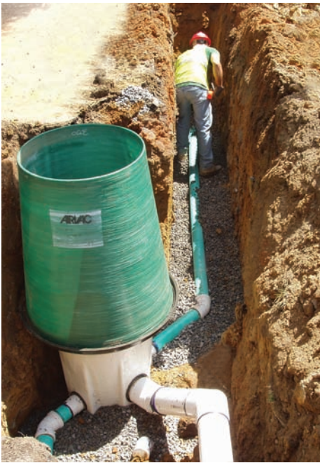
Gravity lines transport sewage from the home just like they do in a gravity system, but at the street or property line, the sewage empties into a buried valve pit.

entry requirements for workmen. Very little maintenance is needed and the system requires less electricity than a