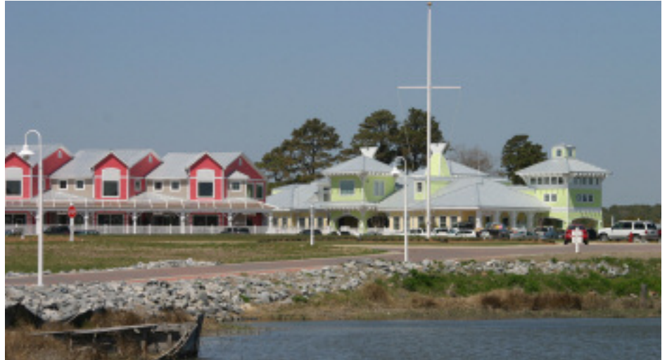
Left: Each valve pit typically serves two connections. Laterals are connected to each home and operate on gravity flow principles. Right: The AIRVAC technology is easily expandable and will include the Bay Creek Marina.