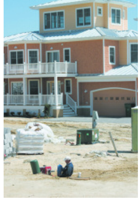
Bill Powell, a technician with the town of Cape Charles, prepares to install a vacuum interface valve.

ents numerous headaches for developers like Foster. The town sits on extremely flat terrain, only 4-7 feet above sea level, so installing a gravity-flow system would require deep trenches - 12-14 feet deep - and at least a dozen pumping stations. Digging deep trenches would require lots of dewatering, as well as trench boxes and numerous safety considerations. The trenches also would require backfilling with select materials, not the sand and mud that would be excavated. Construction costs would be staggering and there would be no certainty that the new system would completely solve the problems of stormwater infiltration and sewage exfiltration.