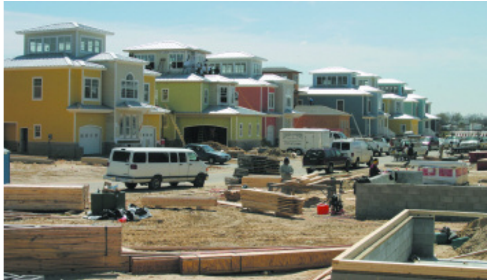
Above: Cape Charles is a thriving town once again thanks to the overwhelming success of the Bay Creek development.

Today, Foster's new Bay Creek development has condominiums and homes that fetch anywhere from $300,000 to $4 million. There are two new golf courses - an Arnold Palmer Signature Course and a Jack Nicklaus Signature Course. There's a new 224-slip marina on the bay, upscale restaurants and shops have opened, and the old town is bustling once again.