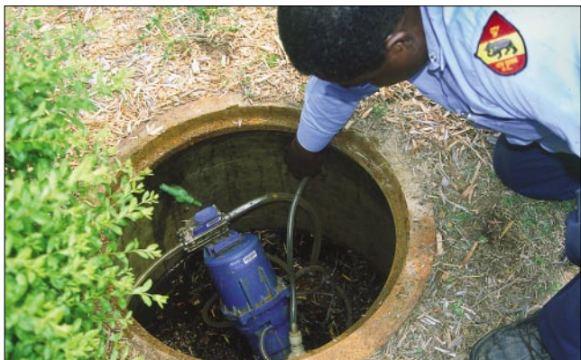
Valve pits are an important part of the AIRVAC technology. Up to four houses can be connected to a single valve pit. The valve operates pneumatically, so no electric power is necessary.

area requires many pumping stations to take effluent from its source to the treatment facility. Excavation is difficult, as trenches have to be cut deep and dewatering is necessary. Additionally, much of the area is well-developed, so the installation crews would have to dig up lawns, shrubs, and streets. When all the costs were analyzed, a gravity sewer simply was too expensive for this community.