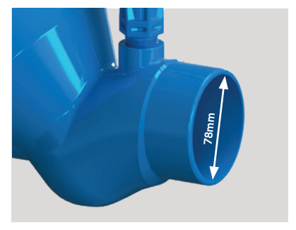
78mm valve diameter