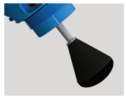
Enhanced rubber plunger design